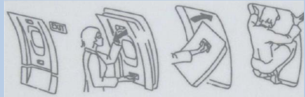
EMERGENCY EXIT OPERATION